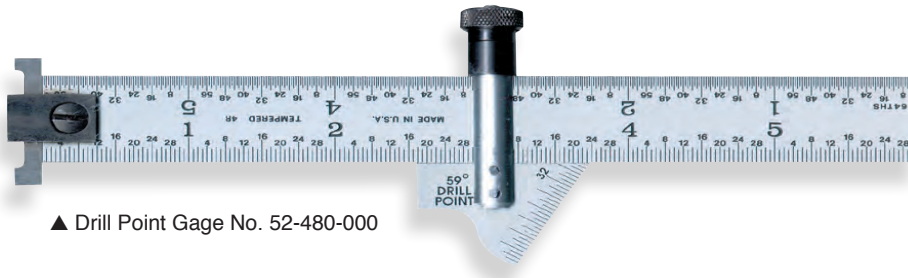
▲ Drill Point Gage No. 52-480-000